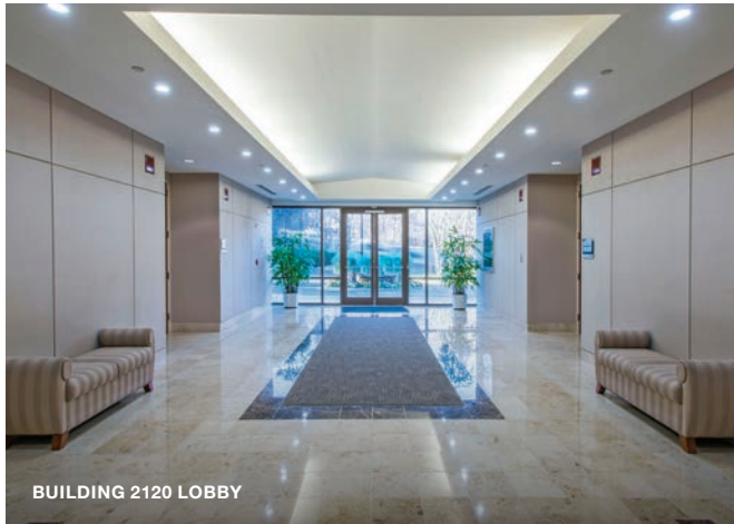
BUILDING 2120 LOBBY

2100, 2110 & 2120 Powers Ferry Rd Atlanta, GA 30339