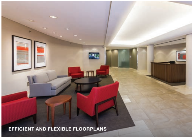
EFFICIENT AND FLEXIBLE FLOORPLANS

Efficient floor plans with abundant natural light and attractive architectural finishes