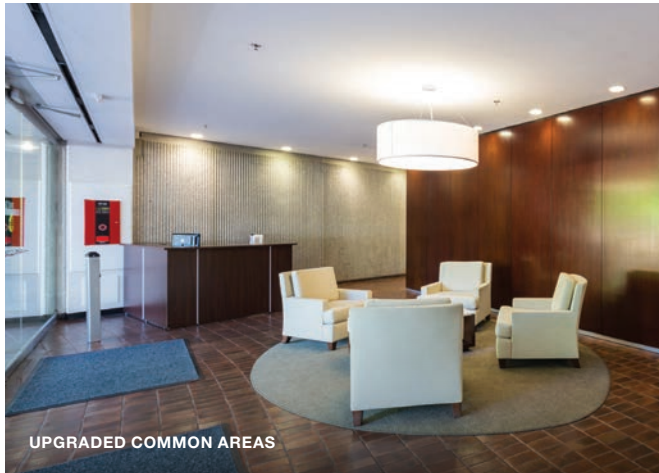
UPGRADED COMMON AREAS

1190 W Druid Hills Dr 2801 Buford Hwy Atlanta, GA 30329