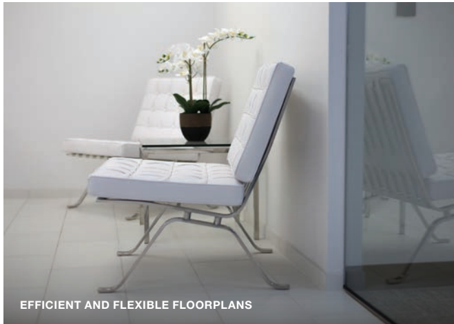
EFFICIENT AND FLEXIBLE FLOORPLANS

The property is currently being converted to mixed use with the addition of apartments and up to 15,000 square feet of onsite restaurants and convenience retail, which will complement the rapidly expanding walkable amenity base in the immediate area